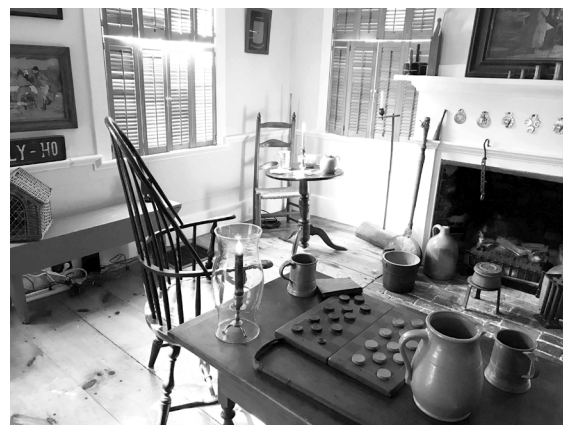
Replica Tavern in Hollis

I don't know if there weren't any more taverns in town after 1851, so the Town decided to try selling alcohol and wine or what. It's all a bit of a history mystery. If anyone has any thoughts or further information, please let me know.