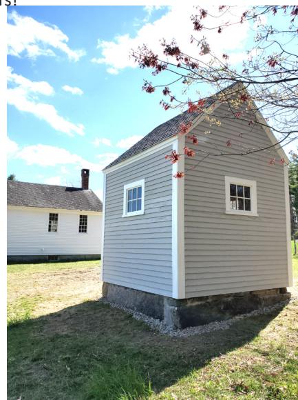
Benjamin Rideout Shop Completed