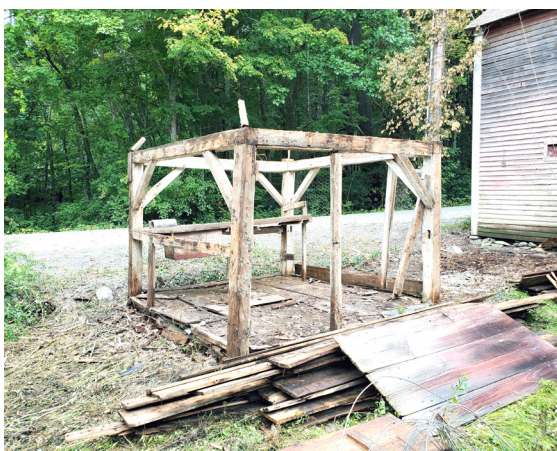
Benjamin Rideout Shop Being Dismantled

Last year, this 200-year-old farmstead came up for sale again. Located on the corner of Broad Street and ‘dirt’ Nartoff Road, it might well have suffered the fate of many an 18th century country farmhouse in this town and been demolished and replaced by something much larger and more modern. But, according to reports, the last owner who had recently passed away placed restrictions on the sale of the property: the house and barn were to be preserved by whomever purchased the property. And, fortunately, that is exactly what happened. After being inspected by a preservation specialist from the New Hampshire Preservation Alliance, it was determined that the old barn on the property was indeed an English style barn with a newer addition – much like the construction of the Lawrence Barn that the Town of Hollis saved from demolition 20 years ago. Oliver Fifield, a preservation carpenter, was called in to save the oldest sections of the barn by dismantling, repairing the timber frame, and re-erecting it to become a functional garage for the homestead.